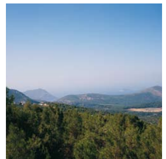
These images, taken from Üzüm Evi, are designed to provide a feel for location

This quite remarkable new property is due for completion in spring 2007. It is located immediately adjacent to Üzüm Evi (see online) and is the brainchild of Şakir and Hülya, who own both properties. Their astonishing concept brings a modern, contemporary style to the mountains, creating one of the most unusual and 'off-beat' properties we have ever discovered – it is truly unique! This romantic hideaway has an extraordinary layout (see description overleaf) and floor-to-ceiling glass frontage provides the most astonishing views – you can lie in your kingsize bed or relax in the deluxe Jacuzzi bathroom next door and look across the mountains to Patara in the distance! The pool and extraordinary open-air kitchen/dining area provide other spots in which to relax and admire the stunning views.